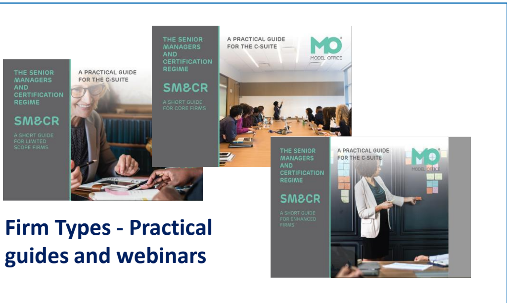
Firm Types - Practical guides and webinars